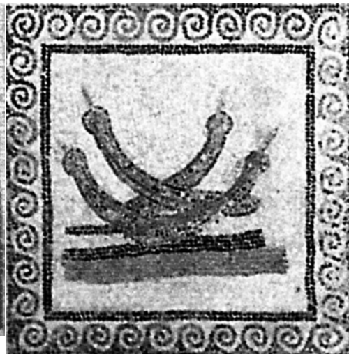
Figure 3. Mosaic depicting round-fruited melons, Cucumis melo , 4 th century, Torre de' Schiavi, Rome (Balmelle et al. 1990). Figure 4. Mosaic depicting bottle gourds, Lagenaria siceraria , late 2 nd century, Tunisia (Balmelle et al. 1990).