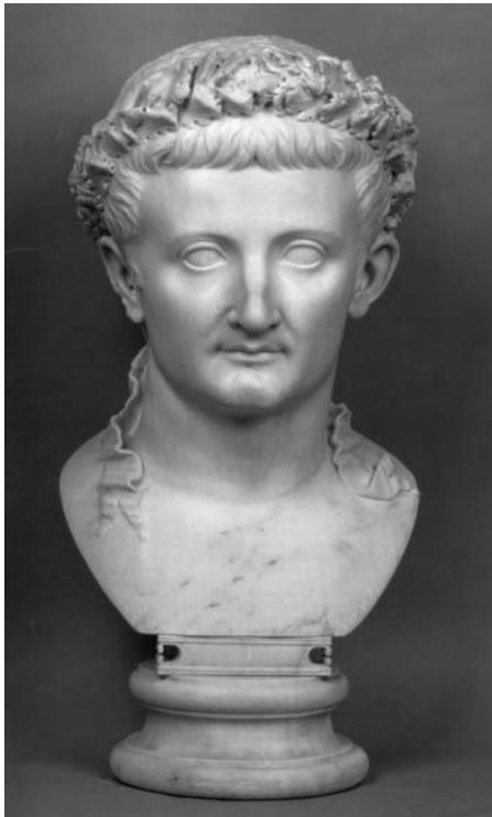
Figure 1. Emperor Tiberius of Rome. Source: Louvre Museum.