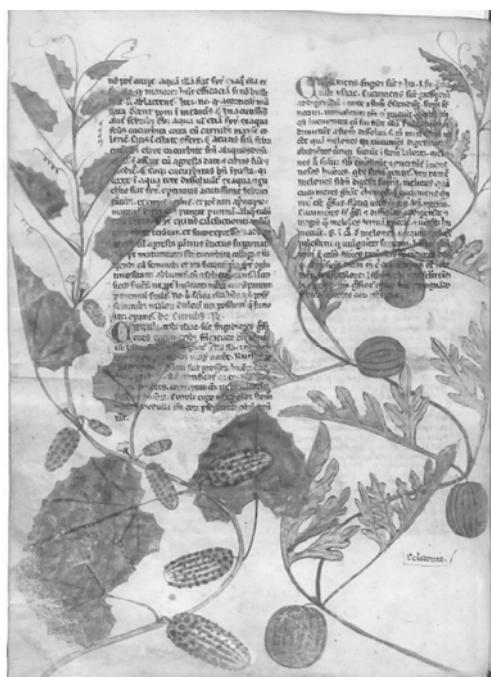
Figure 5. C. sativus (cucumber) left, and C. lanatus (watermelon) right, from the Manfred de Monte Imperiali, Pisa, Italy (ca. 1335).